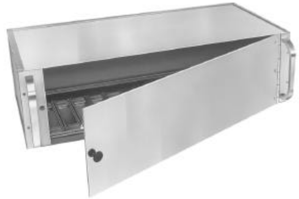
Rack with HFP52-1 Hinged Front Panel (side)